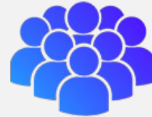
Data Buyer Title Categories

500+ UNIQUE DATA BUYERS REPRESENTING TRILLIONS IN AUM